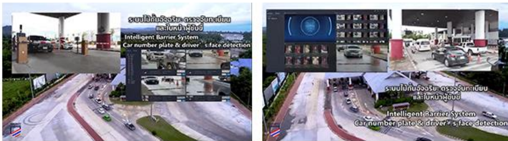
(Vehicle number plate & driver's face detection, elevated body temperature detection)

In addition to that, Phuket polices will also be wearing KEDACOM body worn camera while on patrol at the checkpoint. The camera is designated for clear and continuous video/audio streaming, and the footages can be transmitted back to the command center in real time for official database comparison using our Falcon system. (An intelligent human cognitive system that integrated with face recognition, people search and human big data analysis.)