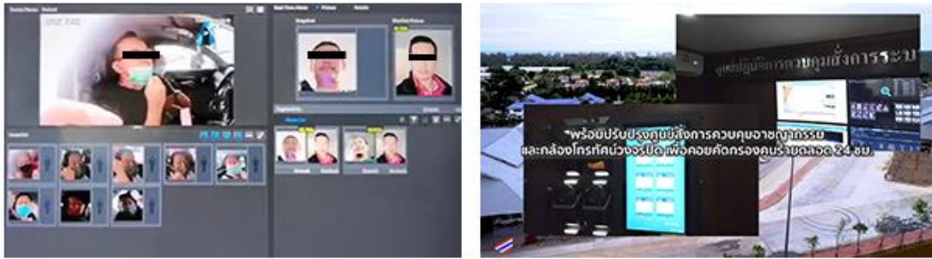
(Real time human face capture via KEDACOM body worn camera and comparison via Falcon system)

KEDACOM LED display screen has been applied to the Command center at Thailand Emergency Call Center 191. Once Phuket has established its network coverage and put KEDACOM display system in use, it will be able to integrate big data visualization with multiple command resources to achieve a smooth and direct command for Phuket police authority, and therefore improve their work efficiency.