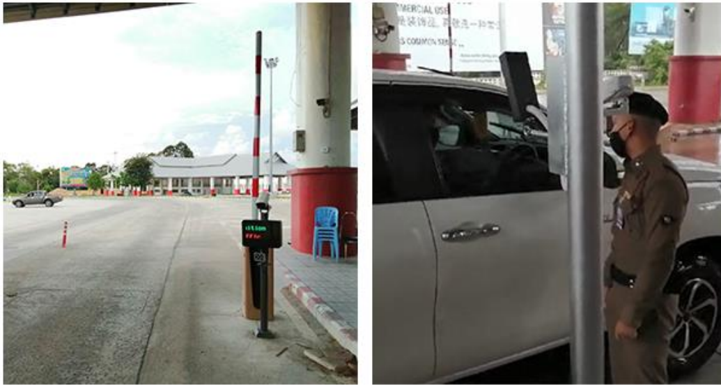
(Vehicle recognition camera and face recognition camera installation)

detect the body temperature precisely of a driver or a passerby, making it the best suited device to help contain the spread of Covid-19.