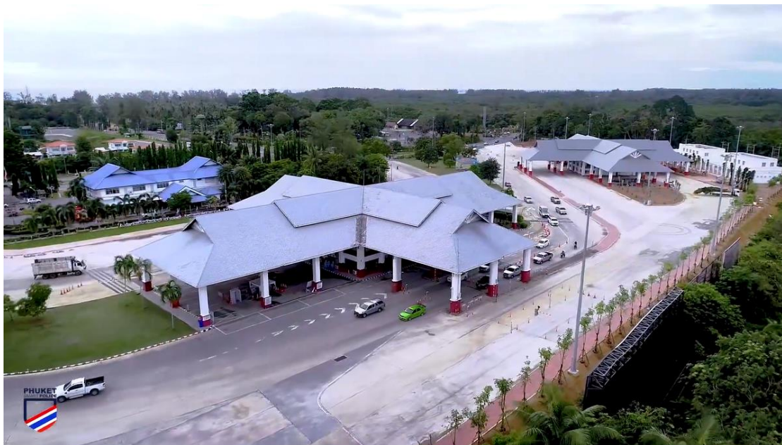
(Tha Chatchai checkpoint, Phuket)

Being the first line of defense for the island, the project is aimed to identify suspicious person and vehicles, as well as support the island's reopening measures after the long closure due to Covid-19 pandemic.